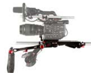
FINAL RESULT / RÉSULTAT FINAL

SHAPE RESERVES THE RIGHT TO USE ANY PHOTOS INCLUDING SHAPE PRODUCTS FOR MARKETING PURPOSES